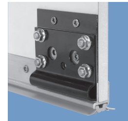
Heavy-duty bottom brackets strengthen bottom.