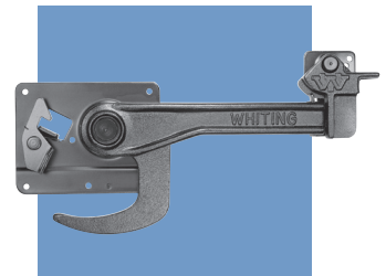
Cam lock allows one hand operation. Accommodates padlock or car seal.