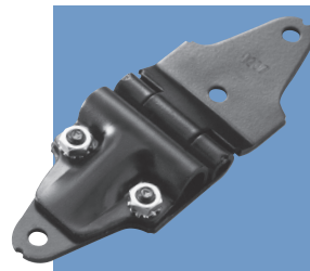
Patented roller-change hinge design.