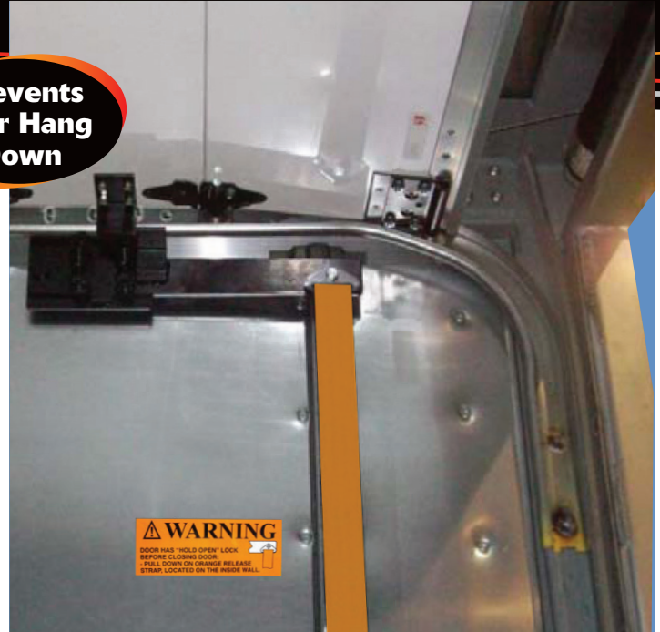
Door is completely out of the opening.