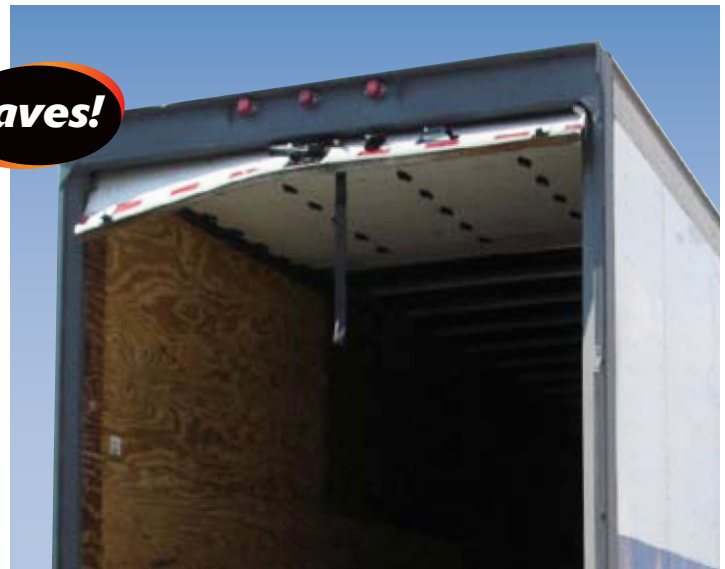
Typical bottom panel damage.