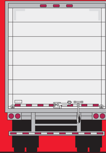
Whiting Roll-up Doors

When you build trailers/truck bodies...it pays to build quality. When you equip them with Whiting Doors...you're getting the best you can buy. Whiting Doors. The standard of quality since 1953.